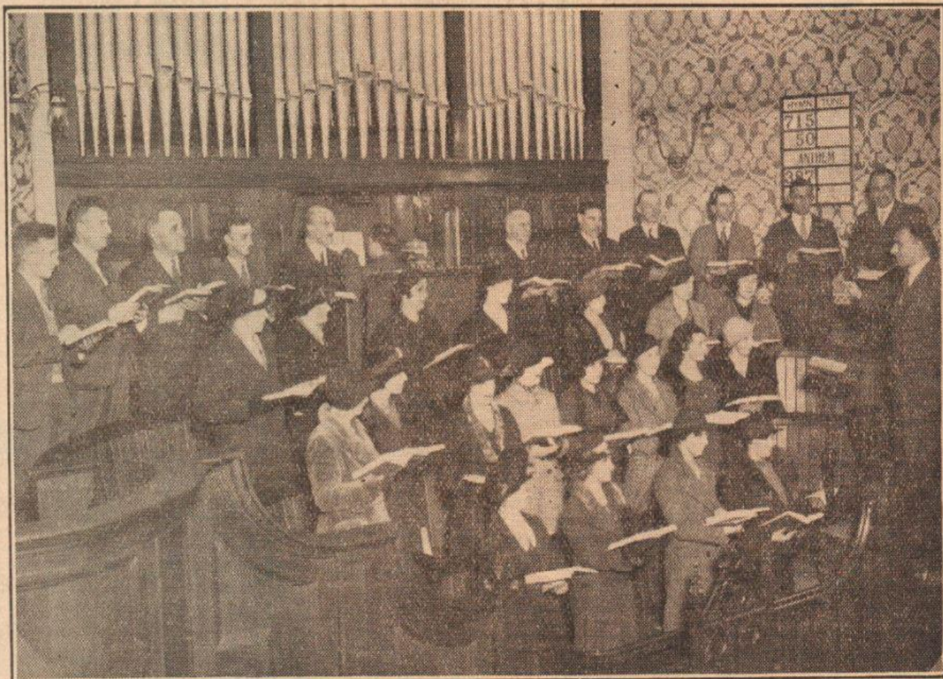
BIDEFORD HIGH STREET METHODIST CHOIR REHEARSING FOR NEXT SUNDAY'S BROADCAST.